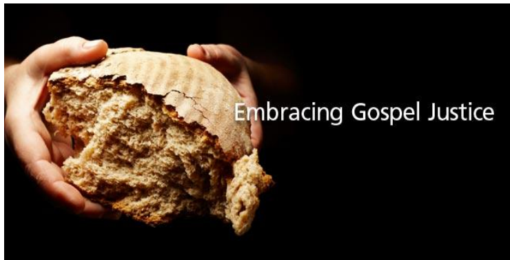
Embracing Gospel Justice