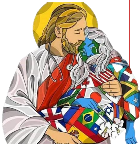
Artist Unknown (shared by Pauline Lally, SP)