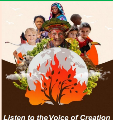
Listen to the Voice of Creation