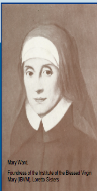
Mary Ward, Foundress of the Institute of the Blessed Virgin Mary (IBVM), Loretto Sisters

Followed by refreshments in the Church Hall